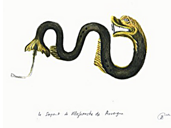
Illustration by Yann Bagot

A concert with all serpent players will take place within the "Labyrinthe musical en Rouergue" festival.